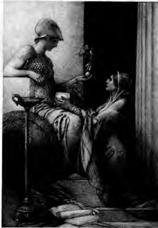
LELAND · STANFORD · JUNIOR · UNIVERSITY